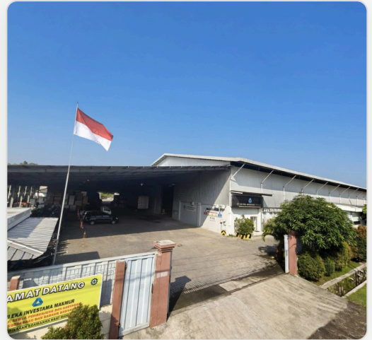
Manufacturing Facility — Semarang, Central Java